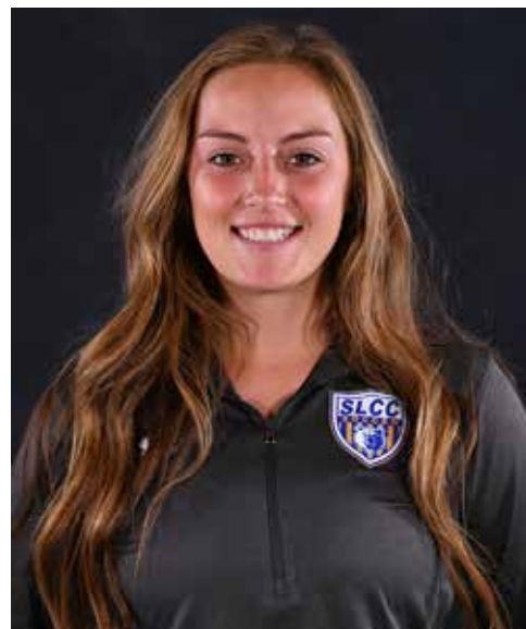
#15 Summer Miles